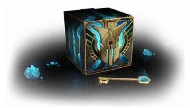
Figure 6: Hextech Chests

The League of Legends has a system of reward mechanisms and habit formation. If the player wins a victory in rank, he can get experience points, blue essence used to unlock new champions, and League Points. And if he performs well in the game or overall team success, may reward him with Hextech Chests (Figure 6) or Key fragments, which can be used to unlock chests that contain skin shards, emotes, and other items.