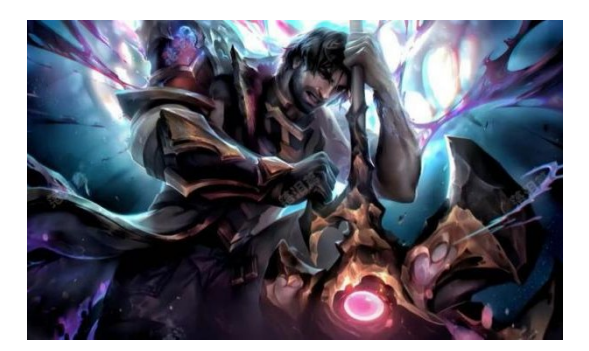
Figure 4: fancy skin for Jayce

The fourth need is novelty and surprise. As shown in Figure 5, League of Legends usually releases an update every two weeks and introduces five new champions on average per year. Make sure the new elements are always emerged in the game. Also, the game emphasizes diverse hero choices, equipment combinations, and tactical adaptations, such as split-pushing, team fighting, or backdooring, which is the most surprising. All these make this game fresh for every game.