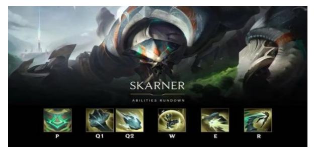
Figure 5: Hero change and update.

The fourth need is novelty and surprise. As shown in Figure 5, League of Legends usually releases an update every two weeks and introduces five new champions on average per year. Make sure the new elements are always emerged in the game. Also, the game emphasizes diverse hero choices, equipment combinations, and tactical adaptations, such as split-pushing, team fighting, or backdooring, which is the most surprising. All these make this game fresh for every game.