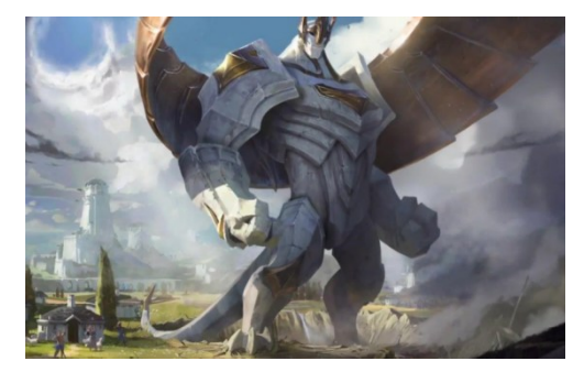
Figure 7: Galio, protective tank

League of Legends produces a proteus effect [5] among players. Players' behavior adapts to the chosen hero's traits. For example, if they chose a tank hero, they may prefer to absorb damage and protect teammates, like Shen and Galio, which is shown in Figure 7, is strong and lofty, offering a sense of responsibility to protect teammates; if they chose an assassin like Zed or Katarina, they might prefer to attack and play aggressively. And due to the excellent work of champions' backstories, players get immersed into the game when they have a psychological identification with champions. Like Jinx's rebellious nature, gain a lot of popularity and more appearance rate.