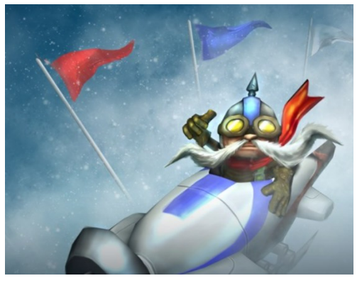
Figure 3: simple skin for Corki

The third need is independence and uniqueness. League of Legends provides multiple champions and playstyle allowing players to showcase individuality. League of Legends designs champions of different species, genders, skin color, statures, appearance, to make sure every player can find an identity in this game. Besides, different styles of skins like Figure3 and Figure 4, and different equipment strategies give a sense of uniqueness.