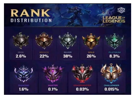
Figure 2: Rank distribution

League of Legends ' design satisfies players' diverse psychological needs, based on the selfdetermination theory [2] and gamification principles [3]. First need is competence and mastery. The League of Legends offers clear skill progression path. For example, the ranking system shown in Figure 2, from Iron to Challenger, and the hero mastery, maximum level 7. Players can experience achievement by earning League Points which determines your ranking in the competitive ladder or improving your hero mastery to gain a special sign. Player can practice and master skill sets for different champions to improve their game strength thus gain achievement.