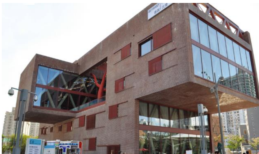
Figure 2. Hamburg house, the first passive house in china (source from internet).

In northern China, the first passive house compliant with the German passive house standard was built in Harbin, the severe cold climate area of China [14]. This ultra-low energy residential building has tighter envelopes to tolerate poor outdoor air pollution, which was compared with conventional buildings to research the characteristics of indoor PM2.5 [15].