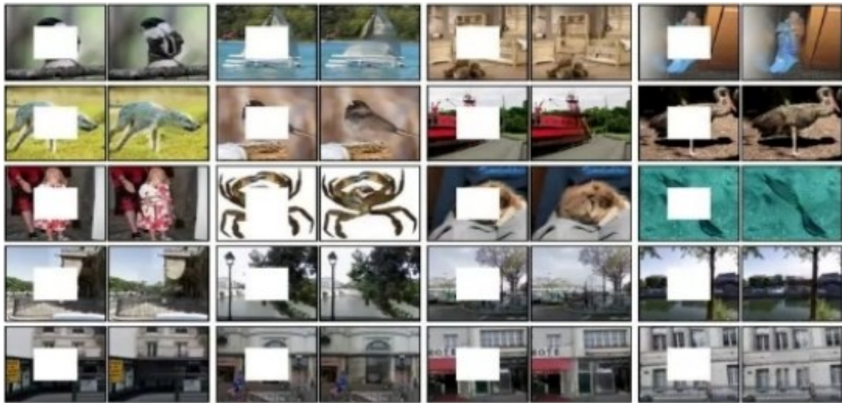
Figure 3: Image restoration based on generative adversarial networks [13]

of multimodal sensor fusion and its importance in mobile robot environment perception [13]. Image restoration based on generative adversarial networks, as shown in Figure 3.