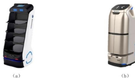
Figure 2: Service-oriented robots [9]

At the core of multimodal sensor information integration lies data fusion technology, which encompasses methods such as Kalman filters, particle filters, and deep learning techniques, among others [8]. The Kalman filter estimates state variables in real-time dynamic environments by optimizing the combination of prior information and observations. In contrast, particle filters are suitable for nonlinear and non-Gaussian environments, and can express the possibility of states through sample distribution; in recent years, the rise and development of deep learning have enabled us to use big data for deep level feature extraction and pattern recognition of sensor data, providing more effective environmental understanding capabilities for mobile robots.