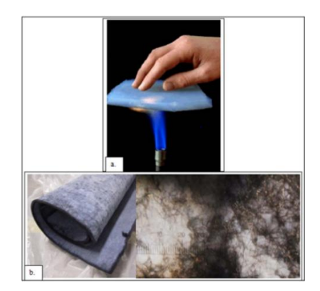
Figure 1. a. Aerogel above an alcohol lamp, b. Aerogel rug (left) and a micrograph of the rug (right) [8].

However, the leakage of aerogel is its mechanic properties: low-temperature resistance, brittleness and low strength, but combining Al_2O_3 or combining Ceramic tile fiber can strengthen aerogel.