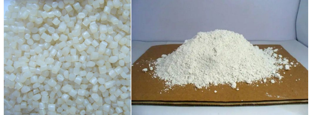
Figure 3. Engineering plastics.

ABS plastic can be used for the outer shell of the product, as it is non-toxic, harmless and wear resistant. The material can also be used for a protective casing around the screen. Because plastic is an insulator, it won't hurt these disabled users. ABS plastic as a printing material, can be printed in the blind text Screen surface, and sensitively make judgments. Almost three layers of ABS plastic, each about 0.3mm thick, are needed to enable blind people to detect the braille pattern by touch. (More clearly). As shown in figure 2. Compared to the previous material, this one is more similar to him, but cheaper. To be more precise, abs plastic Paul is among the engineering plastics, so the first choice for the housing of this product is engineering plastic. As shown in figure 3.