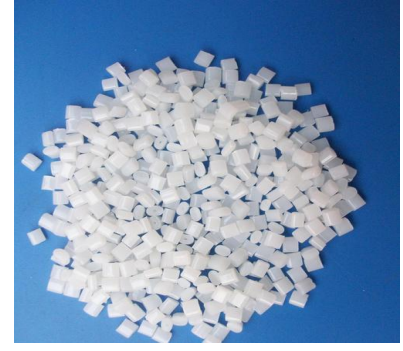
Figure 2. ABS plastic.

properties, wear resistance, chemical resistance, dyeability, molding and processing performance is relatively good.