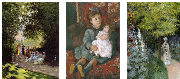
Figure 27 (left): Claude Monet, Park Monceau , 1878. Oil on canvas, 72.7 cm * 54.3 cm, New York: The Metropolitan Museum of Art.