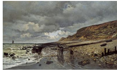
Figure 3 (left): Claude Monet, The Seine Estuary at Honfleur , 1865. Oil on canvas, 89.5 cm * 150.5 cm, Pasadena: Norton Simon Museum.