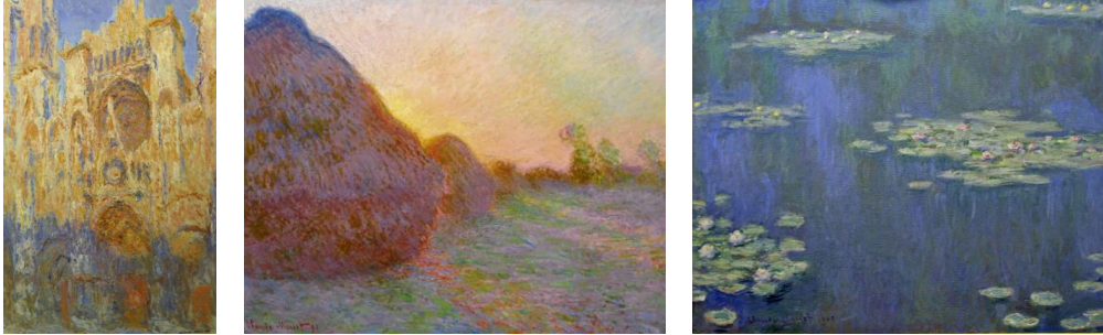
Figure 38 (left): Claude Monet, Rouen Cathedral , 1892-1893. Oil on canvas, 107 cm * 73.5 cm, Paris: Musée d'Orsay.