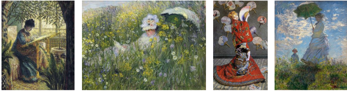
Figure 23 (L1): Claude Monet, Madame Monet Embroidering , 1875. Oil on canvas, 65 cm * 55 cm, Philadelphia: Barnes Foundation.