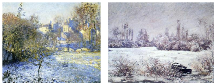
Figure 31 (left): Claude Monet, Frost , 1875. Oil on canvas, 50 cm * 61 cm, Postdam: Museum Barberini.

Because of his wife's death and his lack of income, Monet was devastated for a long time after Camille's death and lived a depressed life for several years, which is reflected in his paintings. 1875, when Camille was still alive, Monet's snowy scene paintings (Figure 31) were warm, bright, and joyful; However, in 1880, his snowy scenes (Figure 32) became dilapidated, dead, and hopeless. He tried to relieve his depressed mood by painting. He painted the Seine in winter (Figure 33), the snowy landscape (Figure 34), the road in front of the town (Figure 35), the cliffs (Figure 36) and the sea in his hometown (Figure 37), but all these scenes were extremely lonely.