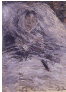
Figure 30: Claude Monet, Camille Monet on Her Deathbed , 1879. Oil on canvas, 90 cm * 68 cm, Paris: Musée d'Orsay.

Camille Monet on her Deathbed (Figure 30) is Monet's last painting for Camille, depicting her death on her deathbed. The dead Camille laid lifelessly on her deathbed with her eyes closed, the bedding wrapped around her just like cold, messy feathers. The entire painting is in blue and purple tones, frozen, still and grieved, just like Monet's emotions when he painted it, which depicts not only Monet's wife but also Monet's heart.