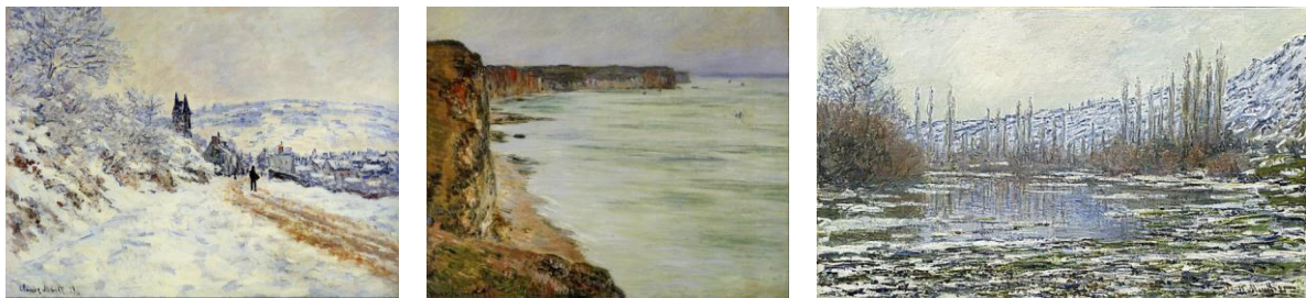
Figure 35 (left): Claude Monet, The Road to Vètheuil, Snow Effect , 1879. Oil on canvas, 61.3 cm * 81.6 cm, private collection.