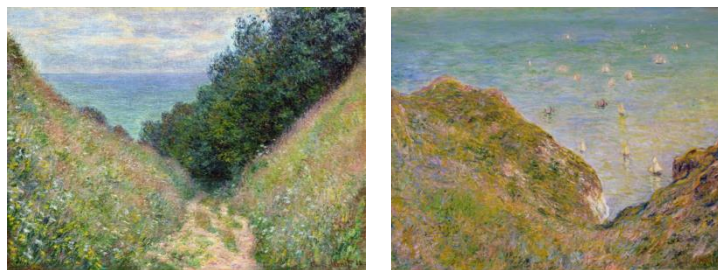
Figure 36 (left): Claude Monet, Path at Le Cavee, Pourville , 1882. Oil on canvas, 105.4 cm * 142.8 cm, Boston: Museum of Fine Arts.

Monet finally got better. The 'worn-out armor' was restored to a 'new military uniform', allowing the lonely painter to face up to his unfortunate life. In 1882, the bottomed-out economy slowly rebounded, the previously bankrupt Durand-Ruel's business got better [23]. Thanks to Durand-Ruel's financial support, Monet's life slowly improved. Colorful colors reappeared in Monet's paintings, just as they had in Path at Le Cavee, Pourville (Figure 36) and View from the Cliff at Pourville, Bright Weather (Figure 37).