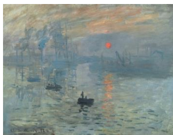
Figure 1: Claude Monet, Impression, Sunrise , 1872. Oil on canvas, 48 cm * 63 cm, Paris: Musée Marmottan Monet.

Claude Monet, a painter who dedicated his life on paint landscapes and people's lives, was also the pioneer of Impressionism, leading French painting in the second half of the 19 th century [1]. He rose to prominence after the publication of Impression, Sunrise (Figure 1) in 1872, and has become a master of Impressionism.