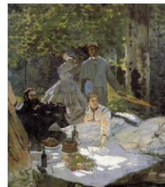
Figure 5 (left): Édouard Manet, The Luncheon on the Grass , 1863. Oil on canvas, 208 cm * 264.5 cm, Paris: Musée d’Orsay.