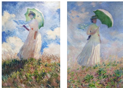
Figure 41 (left): Claude Monet, Woman with a Parasol (Study of a Figure Outdoors, Facing Left) , 1886. Oil on canvas, 131 cm * 88 cm, Paris: Musée d'Orsay.