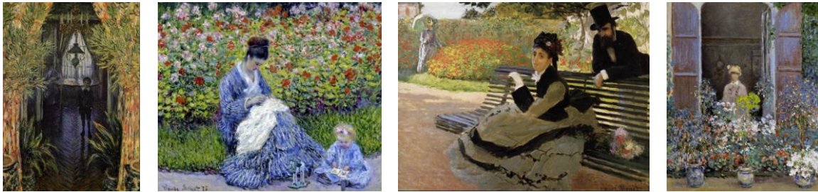
Figure 18 (L1): Claude Monet, A Corner of the Apartment , 1875. Oil on canvas, 81.5 cm * 60.5 cm, Paris: Musée d'Orsay.