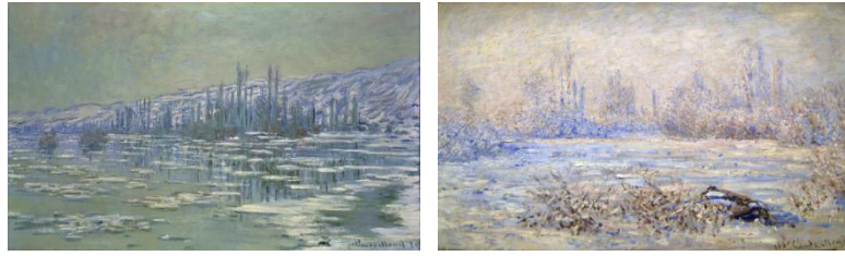
Figure 33 (left): Claude Monet, Ice Floes on Seine , 1880. Oil on canvas.