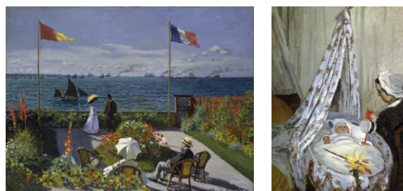
Figure 10 (left): Claude Monet, Garden at Sainte-Adresse , 1867. Oil on canvas, 98.1 cm * 129.9 cm, New York: The Metropolitan Museum of Art.