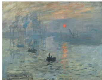
Figure 22: Claude Monet, Impression, Sunrise , 1872. Oil on canvas, 48 cm * 63 cm, Paris: Musée Marmottan Monet.

In 1874, Monet, along with Edgar Degas, Camille Pissarro, Pierre-Auguste Renoir, and other painters of a similar style, organized an exhibition in Paris called the Anonymous Society of Painters, Sculptors, Printmakers, which exhibited many artworks including Impression, Sunrise [19]. The exhibition created a furor in Paris, with the critic Louis Leroy commenting that “all the paintings were just ‘impressions’”, and jokingly named their style as “Impressionism” [20]. It was for this reason that Impressionism finally got its name.