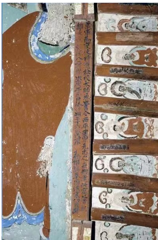
Figure 1: The role of Chinese calligraphy in inferring the history of Song Dynasty

Cave 427 of the Mogao Grottoes in Dunhuang, as a cave originally dug in the Sui Dynasty, underwent a very large scale repair and reconstruction in the Song Dynasty. There's a paragraph on it about the revision: "維大宋乾德八年歲次庚午正月類卯朔二十六日戊辰敕推誠奉國保塞功臣歸義軍節度使特進檢校太師兼中書令西平王曹元忠之世創建此窟簷紀。(Wei Big Song Gan De eight years old Gengwu first month class MAO Shuo 26 hundred days Chen reschi push Chengfeng national security hero return to the army to make special inspection school Taishi and book order Xiping king Cao Yuanzhong the world to create this cave eave)" [3].