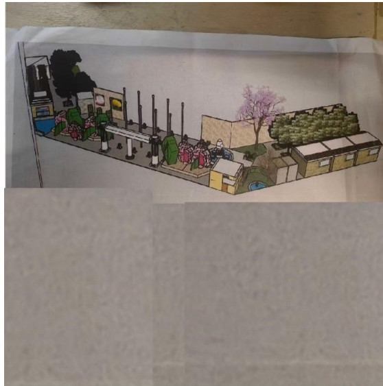
Figure 1: Airview map of the entrance square

[1]. Integrating these symbols fosters an appreciation for Chongqing's cultural heritage. Tea culture symbols are the result of integrating and refining representative content of tea culture. Through tea culture symbols, people can have a deeper understanding of their connotations, and the symbols themselves have practicality, which can enhance the aesthetic value of design when reflected in design. Therefore, it is crucial to combine the current social development needs and the design requirements of the tea environment to achieve the reasonable application of tea culture symbols. Suitable carriers and opportunities should be selected to fully demonstrate the long history and charm of tea culture in China [2]. As is shown in Figure 1 that this project sets 2 groups of camellia statue next to the gate of entrance square.