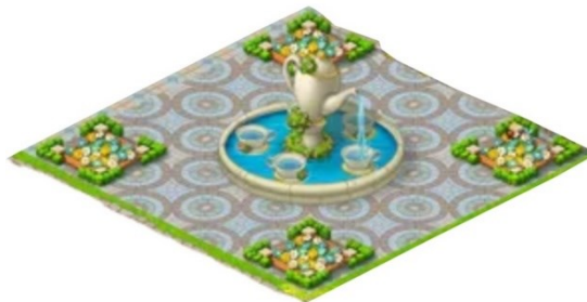
Figure 2: Sculpture of teapot

The interactivity of contemporary public art design is a distinct feature that sets it apart from traditional public art design. Traditional public art works are often only appreciated but cannot be touched or participated in, while contemporary public art design emphasizes the interaction and communication between works and the public, focusing on enhancing the public's sense of participation and experience [3]. Thus, as shown in Figure 2 that this study combined teapot statue with floating water ejection device so people can touch the floating water.