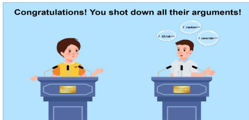
Figure 3: Arrows shot down the arguments.

Another metaphor would be that ANGER IS HEAT. After wearing the VR glasses, students will find themselves in a virtual classroom scene. Then, the students will hear the instructions from the devices to ask them to press the trigger button once. After the students press the button, they will start daydreaming and look in all directions. After a while, they are noticed by the teacher. And at this time, the students will see the teacher is very angry with smoke coming from her head. Then, a line of words "The teacher is fuming!" will appear in the student's field of vision. Then, the students will hear the sound from the devices to let them press the button again. Likewise, after pressing the button, the students will start passing notes to their tablemates sneakily and stop paying attention to the lecture. After they are caught on the spot by their teacher, she will ask students and their parents to come to the office after class. At this point, the scene switches to the teacher's office. When the parents arrive, the students will see smoke coming from their heads as well, which means they are angry. Once again, a line of words "Parents are fuming!" will appear in the student's sight.